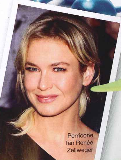
Perricone fan Renée Zellweger